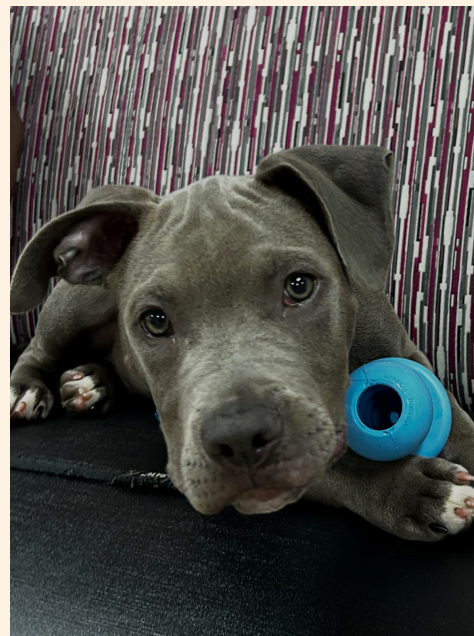
Zeus with Paws for Life Rescue recovers from neuter at AAAR.

“Economically and strategically, it was brilliant. Play the long game to prevent hundreds of thousands of future homeless pets with a nominal investment per animal sterilized. It was exactly what we were looking for to make the biggest impact for animals.”