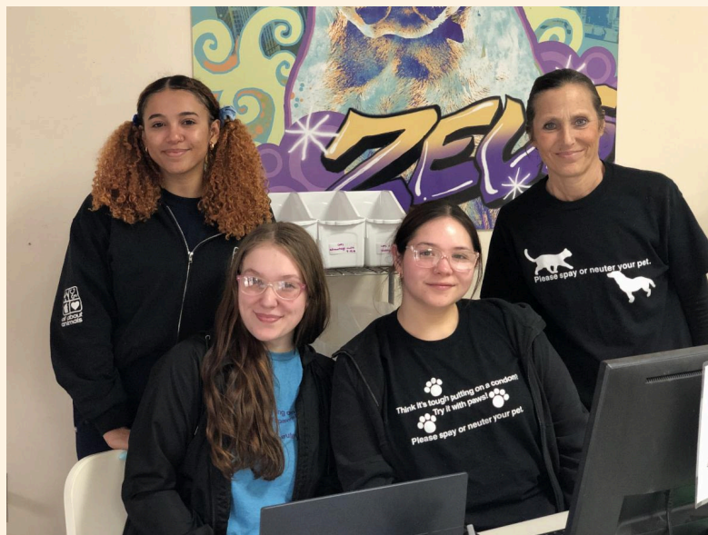
All About Animals Detroit Team

Michigan Pet Alliance is incredibly proud to have All About Animals as a nonprofit member.