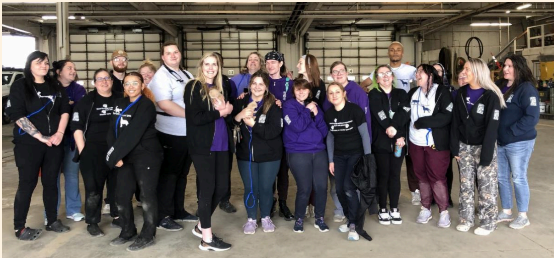
All About Animals Shot Clinic Team